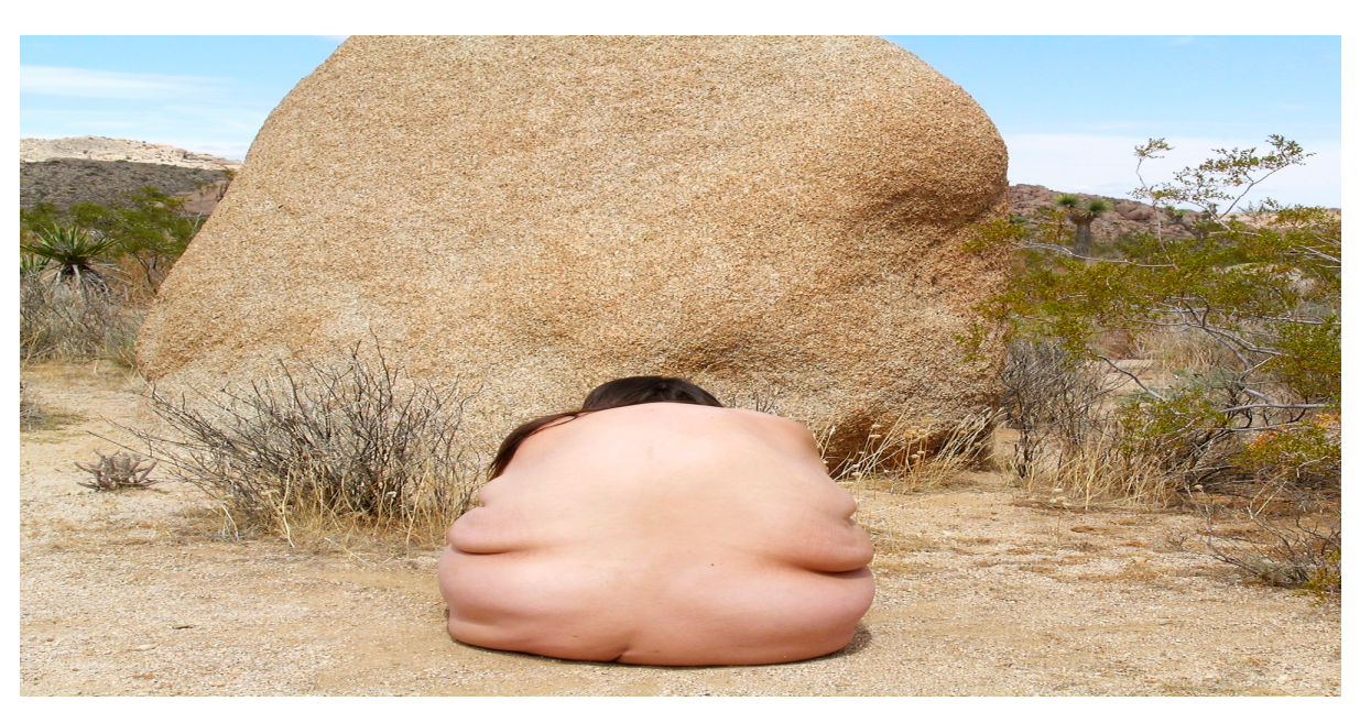
Laura Aguilar, "Grounded #111" (2006), inkjet print, 14 1_2 x 15 inches (© Laura Aguilar; image courtesy Leslie-Lohman Museum of Art)